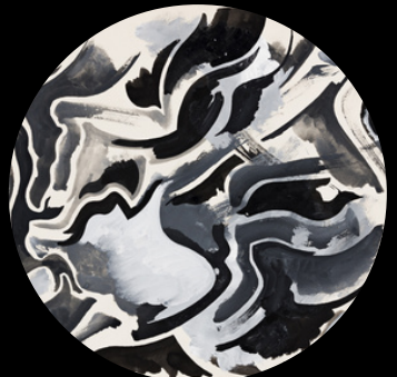
Joe Brainard The Rose , 1992

baby Blue, 32 black, 21, 26, 33 bright orange, 30, 36 brown, 19 (2), 28, 31, 86 brown-Green, 19 dark green, 39 dark Red, 7 dark tan, 25 gold, 22 gray, 27 gray-silver, 36 green, 6,19(2),26(2),86