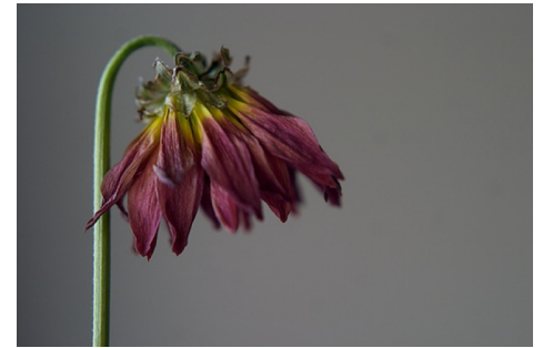
image from The Withering of a Blooming Youth

In her haunting and cryptic poem, alphabet , Inger Christensen utilizes a multitude of themes that push the reader to devote their attention to notice the subtle details and shifts that truly establish alphabet as a critical and thought-provoking poem. One of the themes that was embedded within the onslaught of ideas and words is the curious concept of metaphysics. You may wonder, what is metaphysics? It is not an ordinary word you come across in your everyday life, but it is a concept that involves everyone and everything. In particular, metaphysics is often described as a branch of philosophy that explores the fundamental nature of reality, being, knowing, space, identity, and other abstract concepts that often evade the presence of our minds.