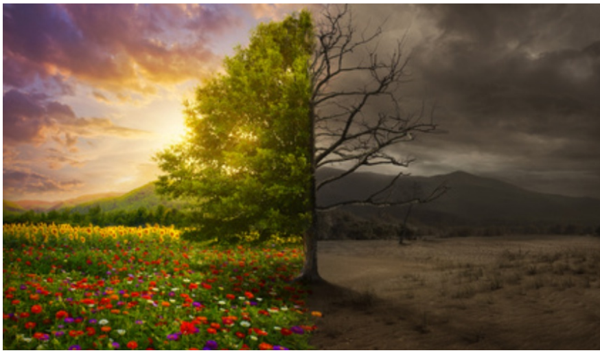
image from Between Life and Death